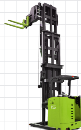
RB15S 3000-9000MM 1500KG