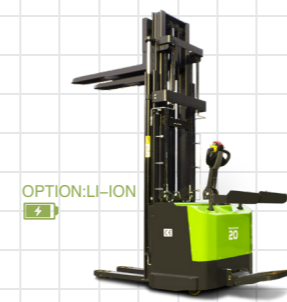
OPTION:LI-ION DB12/15/20R 2500-6200MM 1200-2000KG