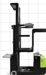
PB05H 4800MM 500KG