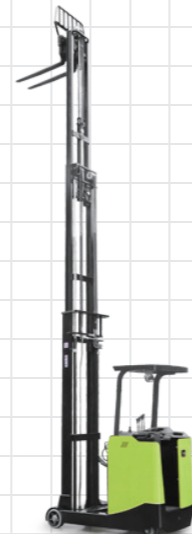
YB-Stand Type 3000-6500MM 1500-1600KG