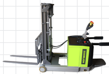
YB-Stand Type 2500-4500MM 1500KG