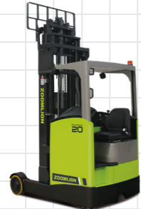
YB-Seated Type 3000-11500MM 1600-2000KG