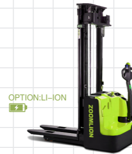
OPTION:LI-ION DB12/16/20W 2500-4600MM 1200-2000KG