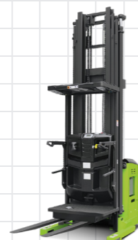
PB07H 9000MM 700KG