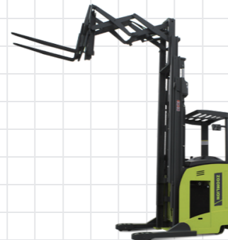
YB-Scissors Type 3000-5500MM 1500-1800KG