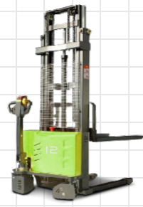
DB12A 1600-3300MM 1200KG