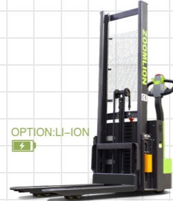
OPTION:LI-ION DB10/12/15E 1600-3300MM 1000-1500KG